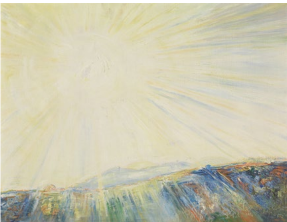
Albert Trachsel Soleil 1909 Oil on canvas 57 x 73 cm République et Canton du Jura, Collection jurassienne des beaux-arts © République et Canton du Jura, Collection jurassienne des beaux-arts. Jacques Bélat