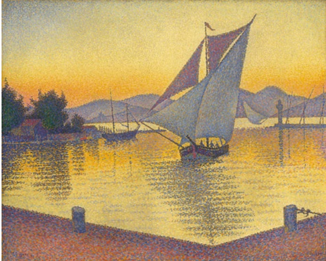
Paul Signac Le Port au soleil couchant, Opus 236 (Saint-Tropez) 1892 Oil on canvas, 65 x 81 cm Potsdam, Museen der Hasso Plattner Foundation gGmbH