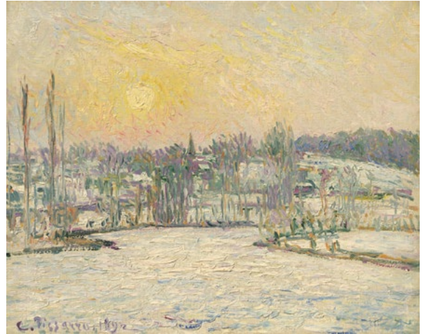
Camille Pissarro Bazincourt, effet de neige. Coucher du soleil 1892 Oil on canvas, 32 x 41 cm Potsdam, Museen der Hasso Plattner Foundation gGmbH