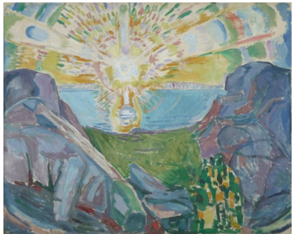
Edward Munch The Sun 1910–1913 Oil on canvas, 162 x 205 cm Oslo, Munchmuseet