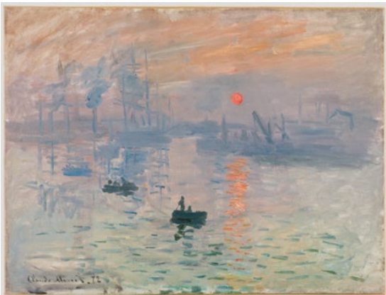
Claude Monet Impression, soleil levant 1872 Oil on canvas, 50 cm x 65 cm Paris, Musée Marmottan Monet