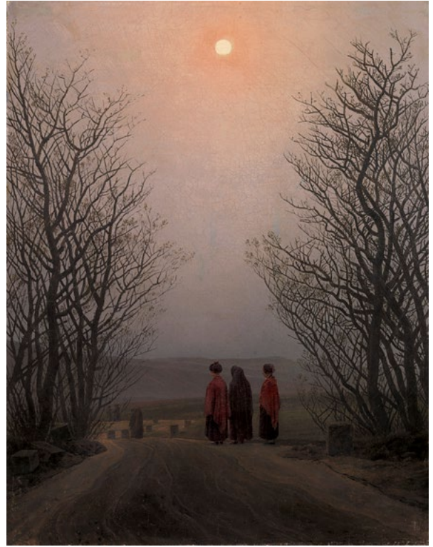
Caspar David Friedrich Easter Morning c. 1828/1835 Oil on canvas, 43.7 x 34.4 cm Madrid, Museo Nacional Thyssen-Bornemisza, Madrid