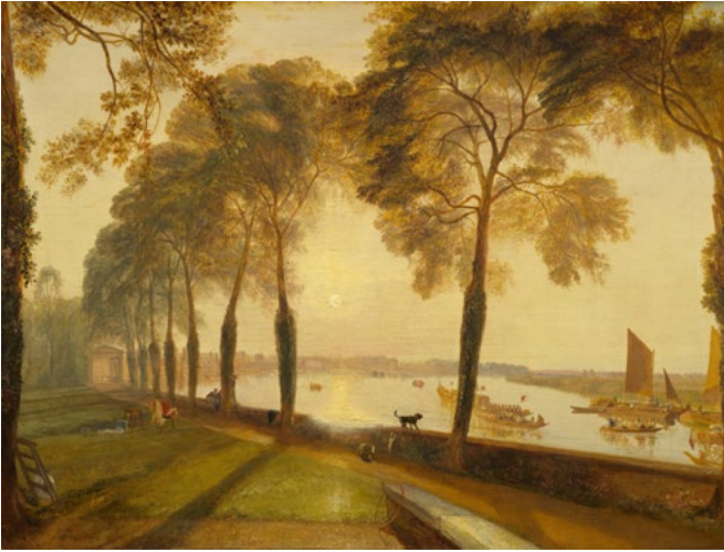
William Turner Mortlake Terrace 1827 Oil on canvas, 92.1 x 122.2 cm National Gallery of Art, Washington, Patrons' Permanent Fund, 1990.1.1