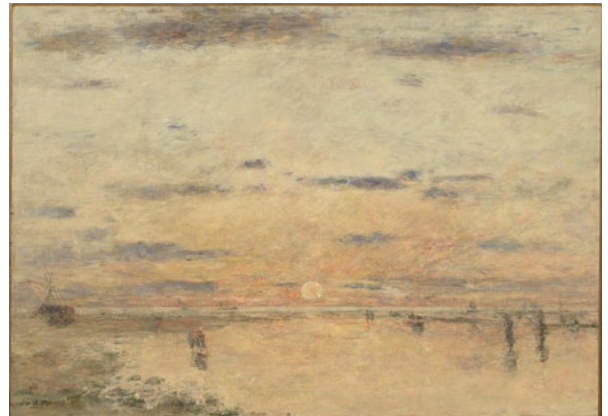
Eugène Boudin Le Havre: Coucher de soleil sur la mer 1885 Oil on canvas, 65 x 92.5 cm Potsdam, Museen der Hasso Plattner Foundation gGmbH