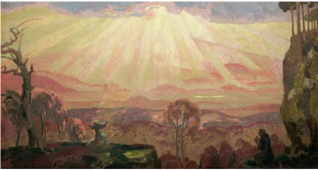
Maurice Denis Saint-François recevant les stigmates 1904 Oil on panel, 60.5 x 115.5 cm Paris, private collection