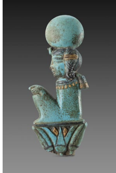
Amulet in the form of a child, image of the rising sun 3rd quarter of the 2nd millennium BC Earthenware, 7.1 x 3 x 0.5 cm Geneva, Fondation Gandur pour l'Art