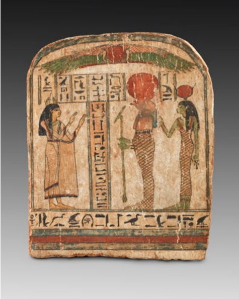
Curved funerary stela in honour of Lady Tahy 7th – 6th centuries BC Wood, stucco, and polychrome pigments 24.7 cm x 20.5 cm x 2.2 cm Geneva, Fondation Gandur pour l'Art