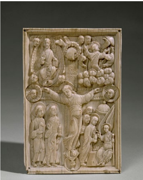
Crucifixion, bookbinding plate Circa the year one thousand, Cologne Ivory carved in bas-relief 17.4 x 11.7 x 0.8 cm Paris, Musée de Cluny - Musée national du Moyen Âge