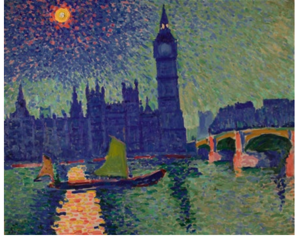
André Derain Big Ben 1906 Oil on canvas, 79 x 98 cm Troyes, Musée d'art moderne de Troyes, collections nationales Pierre et Denise Levy