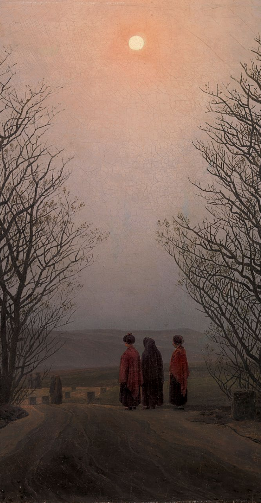
Caspar David Friedrich, Easter Morning, c. 1828/1835, Madrid, Museo Nacional Thyssen- Bornemisza, Madrid