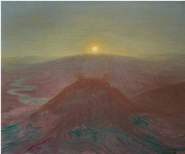
Charles Marie Dulac Soleil levant à Assise 1897 Oil on canvas, 41.5 x 54 x 3 cm Collection Lucile Audouy