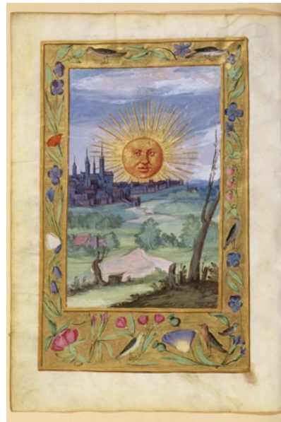
Coucher de soleil sur la ville Splendor Solis, alchemy treatise, 16th century Folio 35 v (left) – vellum manuscript, 50 pages 30.8 x 22 x 3.8 cm Paris, Bibliothèque nationale de France, Manuscripts Department