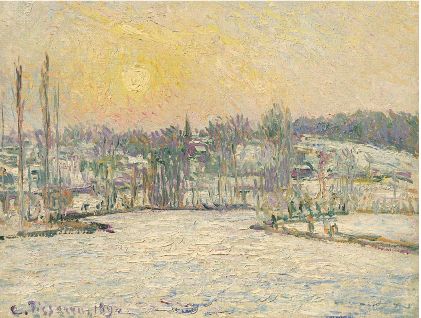
Camille Pissarro Bazincourt, effet de neige. Coucher du soleil , 1892, Oil on canvas, 32 x 41 cm, Hasso Plattner Collection / Sammlung Hasso Plattner